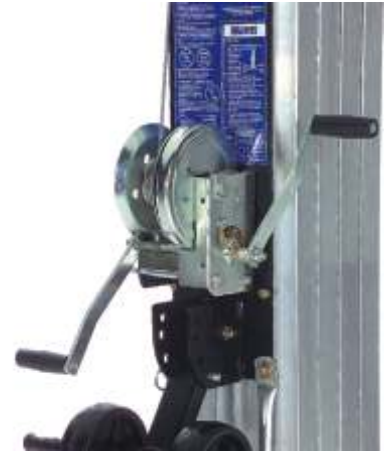
Singlespeed or doublespeed winch available