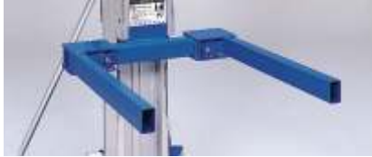
Adjustable forks: enables various working widths.