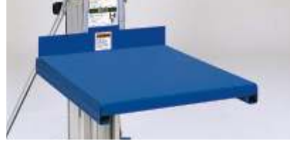
Heavy load steel platform: put on standard or adjustable forks