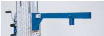
Crane boom: enables the use as perpendicularly crane.