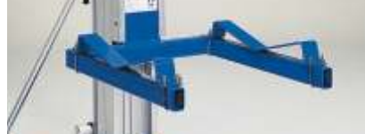
Pipe cradle: for use with standard or adjustable forks.