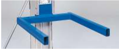
Standard forks: for lifting and assembly works. Reverse assigned, increase the working height around 0,5 m.

Load capacity: 300kg | 5 different working heights | various applications by exchangeable attachments