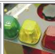
Overload warning lamps + auto stop + alarm