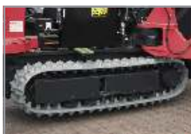
Low marking tracks