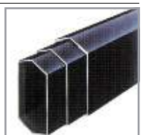
Hexagonal boom minimises sway