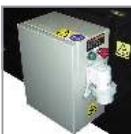
Optional mains power