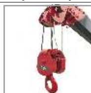
Anti two-block system