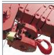
Automatic hook stow