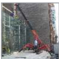
Level operation on uneven sites